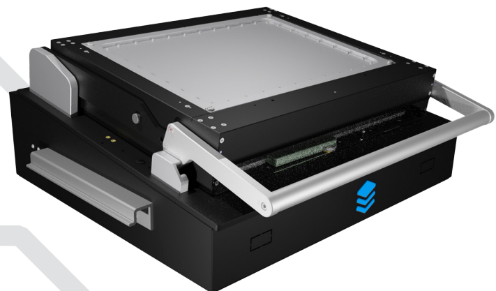
Nd-MFS-D4-RF Fixture Kit implemented with RF Exchangeable Unit