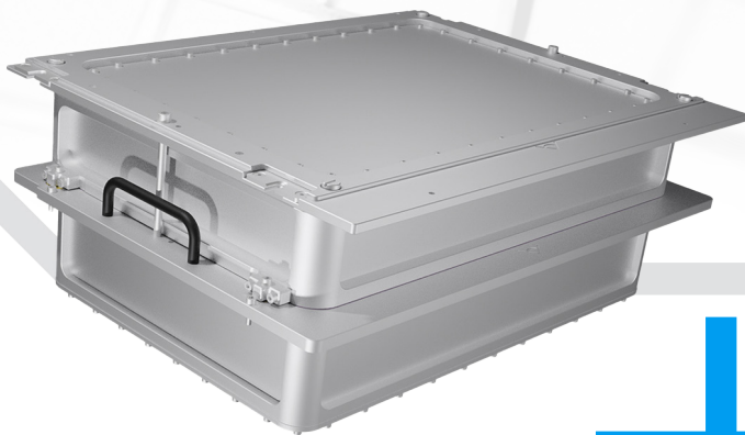
Empty Nd-MFS-D4-RF Fixture Kit